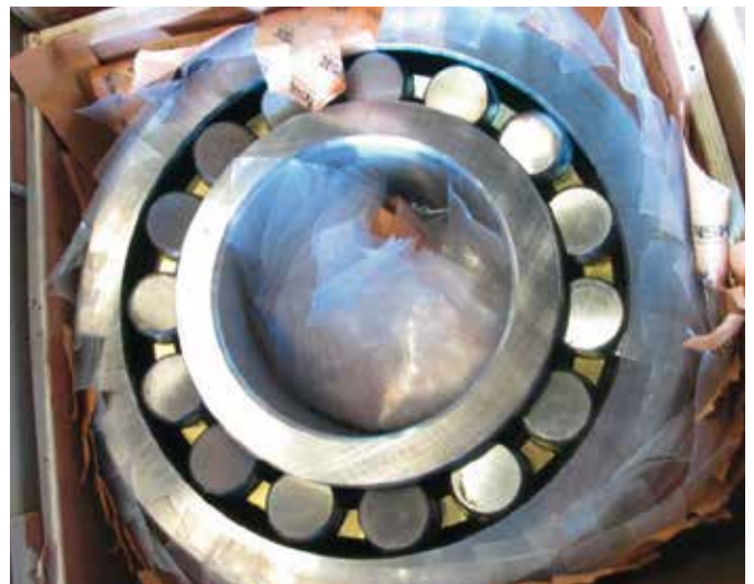
Both images are counterfeit. Incorrect wrapping and no markings on bearings.