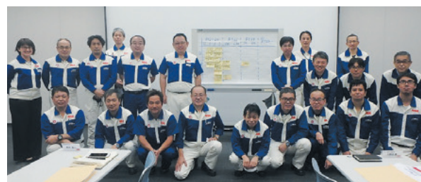
NSK Haruna Plant Safety Culture Workshop: Discussion and establishment of a plant-wide action plan.

NSK is introducing and conducting safety culture workshops led by managers at each site on a global basis, with the goal of fostering an interdependent safety culture throughout the Company. During each two-day safety culture workshop, managers learn about risk management, and discuss and set up actions that will raise the safety culture level further at their respective sites. Managers then convey the significance of these activities to the next level of staff. Ultimately, we aim for a safety culture in which every employee has the same belief regarding safety and a sense of mutual respect for others.