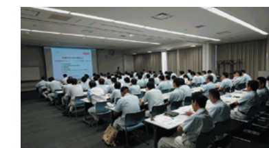
Training of DR experts in Japan

NPDS is short for NSK Product Development System. By implementing a series of operations related to ensuring inherent product quality from the start of the project to mass production, improving the level of these activities leads to improvements in customer satisfaction. In particular, design review (DR)—which is carried out by gathering together project stakeholders at each stage of NPDS—is an important activity for preventing defects. In response to the increase in overseas-designed products, NSK is training overseas DR experts with the aim of enhancing the quality of overseas products by having local personnel conduct design reviews.